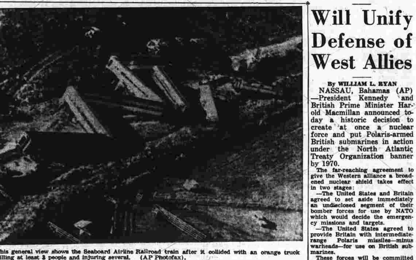
This general view shows the Seaboard Airline Railroad train after it collided with an orange truck killing at least 3 people and injuring several.