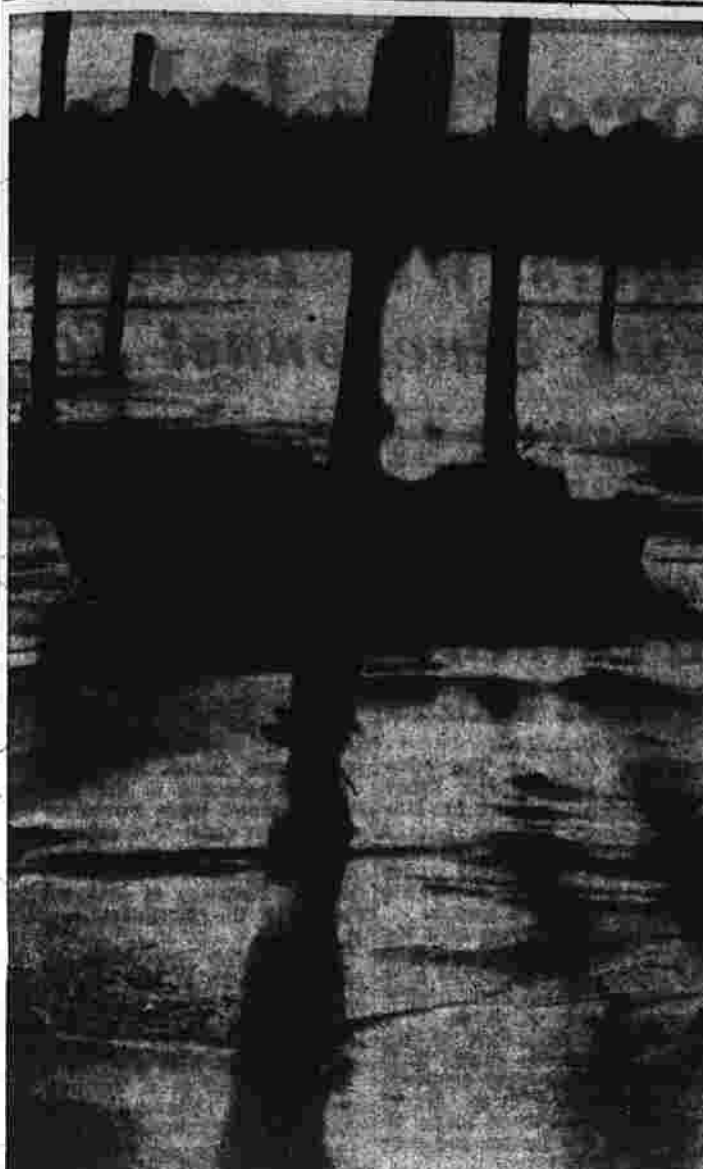
Frozen in Salt Water Lone skiff lies frozen at her mooring in Green Cove in Rhode Island today. The current cold wave caused the salt water covers to freeze for the first time this season.